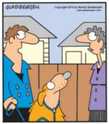
"I always bring Rusty with me. A 10 minute walk equals a 70 minute walk in dog yearst"